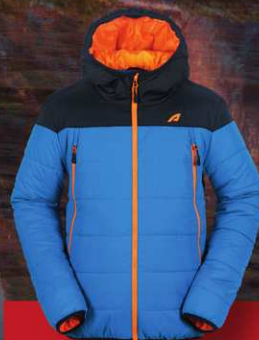
Men's lightweight Ski Jacket