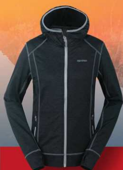
Women's hooded train Jacket