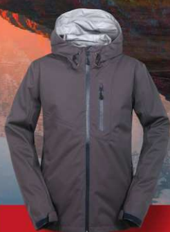
Men's 3-layer Outdoor Jacket